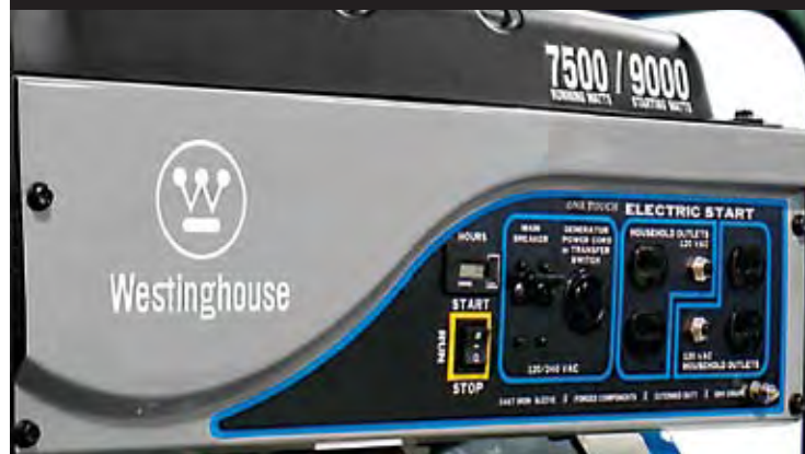
Clean and simple to use control panel - includes hour meter.